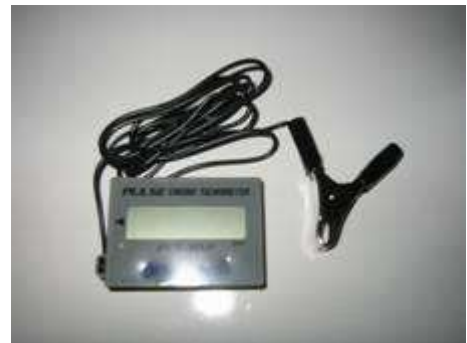
r.p.m. meter Item No. 9992124